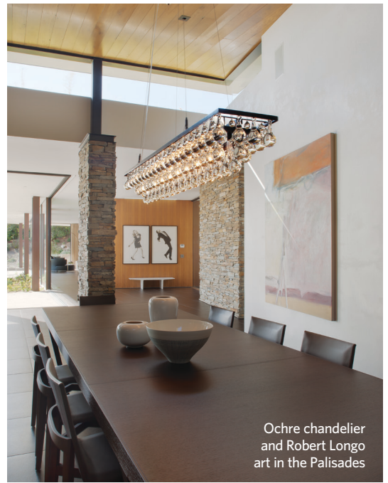
Ochre chandelier and Robert Longo art in the Palisades

"The concepts of purity of design and the home as a sanctuary resonate with our clients," she says. "Some designers focus on the home as a showplace. Our clients appreciate the